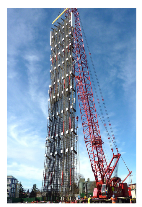
Rebar cage lift

Caption: A crane lifts a 130 foot-long rebar cage. The rebar cages are inserted into shafts in the ground. The shafts are then filled with concrete. The columns will form the underground walls of the future light rail station.