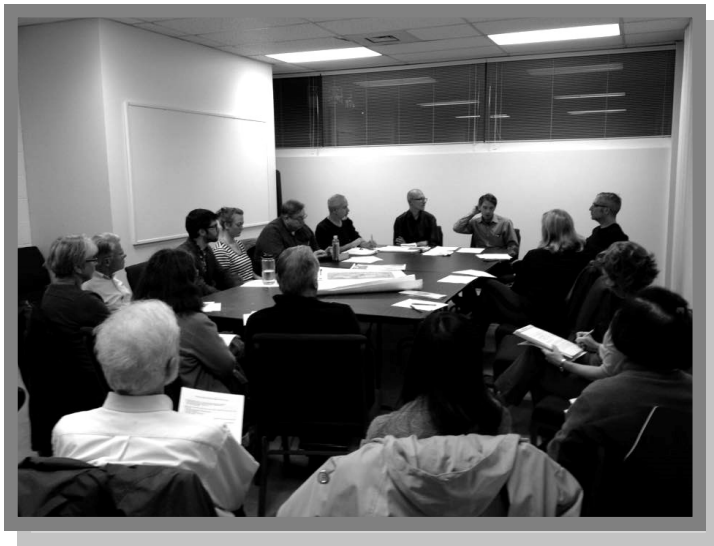
October 14, 2014 Roosevelt Design Guidelines Meeting at CCA.

There was an excellent turnout for the October 14th meeting to discuss revisions to the Neighborhood Design Guidelines. Seventeen people were present including two from the City of Seattle Department of Planning and Development (DPD).