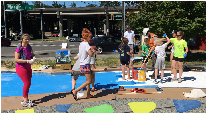
Volunteers paint the street