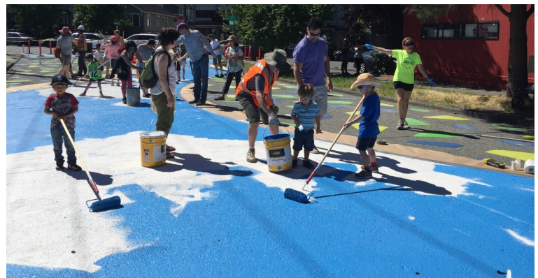
Volunteers paint the street

If you would like to get involved with the project (i.e. helping with the planters, helping make artwork on adjacent buildings a reality, future phase planning, grants) we would love to hear from you – weedinplace@rooseveltseattle.org